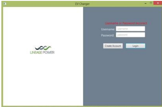
(b) Login Interface at Charging Station for the Customer